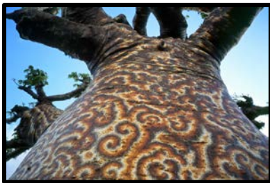
Baobab Quest - Beyond the Ave of the Baobabs