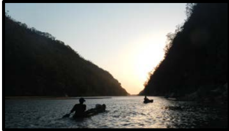
Mangoky River & National Parks