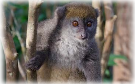
Lemurs of the Kirindy Forest Reserve