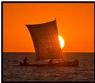
Annular Solar Eclipse ~ September 2016