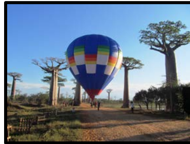
Island of Lemurs: Madagascar