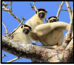
East meets West