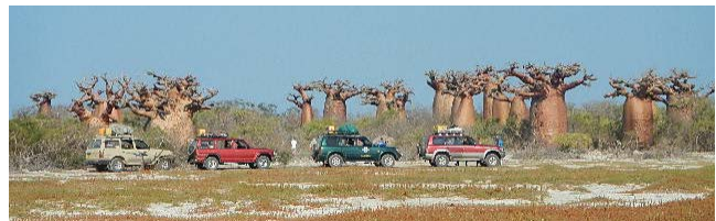
New Baobab & Succulent Galleries