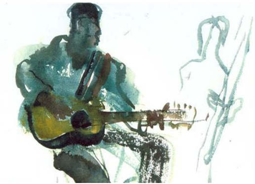
Watercolors ® Courtesy of Deborah Ross New York, New York