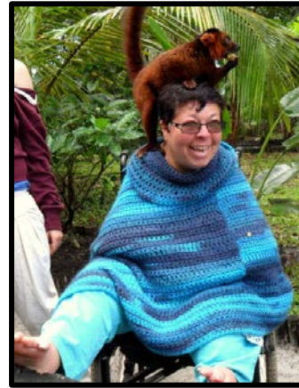
Accessible Madagascar Adventures