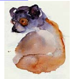
New Fauna Gallery