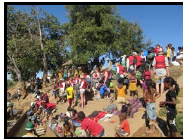
Student Group Galleries